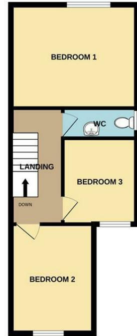
1ST FLOOR 416 sq.ft. (38.7 sq.m.) approx.